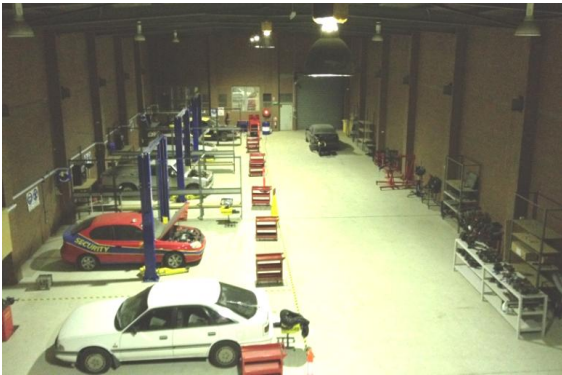
ACE Workshop at 347 Victoria street