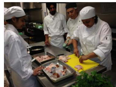
Trainers instructing student at Donald st Campus