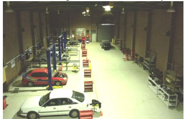
ACE Workshop at 347 Victoria street