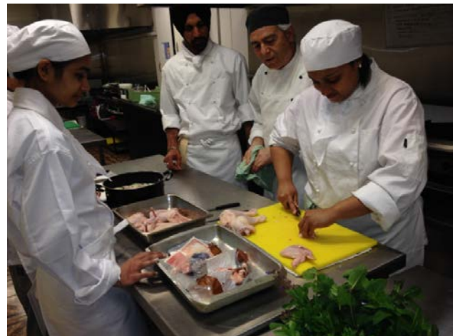
Trainers instructing student at Donald st Campus