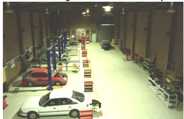
ACE Workshop at 347 Victoria street